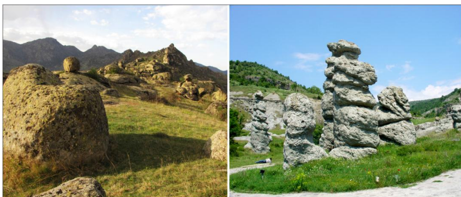
Fig. 2. Protected geomorphological sites – natural monuments. left: denudation landscape at Markovi Kuli near Prilep (placed on the UNESCO World Heritage Tentative List); right: the earth pyramids at Kuklica near Kratovo.

In the geological structure of several mountains, gneisses, granites, granodiorites, andesite, ignimbrites and other rocks which are prone to denudation are dominant. Therefore, a denudation relief is present on them, which in many places is unusually expressed. Particularly remarkable occurrences of denudation landscape (boulders, stone walls, small denudation forms, chaos from blocks, etc.) are found on the Selečka Mountain (1,471 m), the Babuna range with Zlatovrv (1,422 m), the eastern branches of the Mokra Massif, the southern slopes of Ogražden (1,745 m), the southern slopes of Kozjak (1,355 m) to Stracin, mountain Mangovica (Milevski & Miloševski, 2008) and others. The denudation landscape of these mountains, in particular the Selečka Mountains and Zlatovrv, (Markovi Kuli site) constitutes a large complex with numerous and extremely diverse forms (Fig. 2) for which it has been considered as internationally unique (Kolčakovski & Milevski, 2012). These and other areas with a typical denudation relief are very important for the geomorphological heritage of the Republic of Macedonia and as such 12 new sites are recognized and should be fully protected, properly managed and promoted.